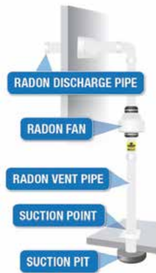
radon mitigation system

A radon mitigation system is installed with a fan that draws air (and radon) up from beneath the foundation and discharges the radon to the outdoors. This system reduces radon levels by preventing radon from entering your home.